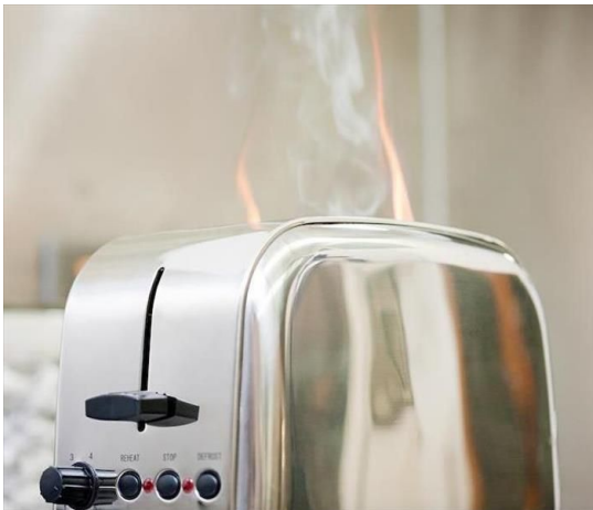
LEAVING TOASTER ON FIRE