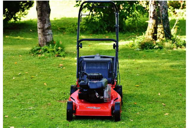
CUTTING MY GRASS