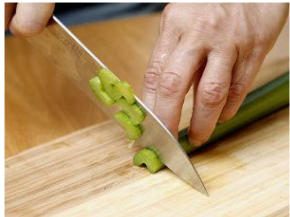
CUTTING WITH KNIFE CLOSE TO FINGERS